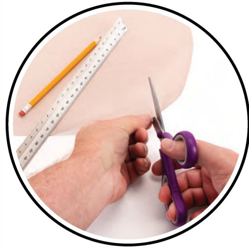
Step 2: Measure, mark and cut protective film to desired size.