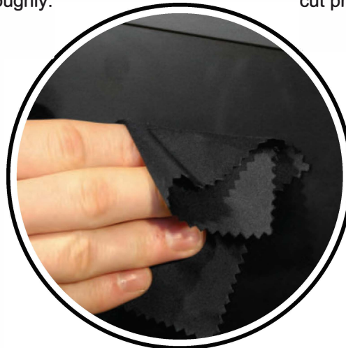
Step 3: Clean screen (or surface area) with microfiber cloth (Not Included).