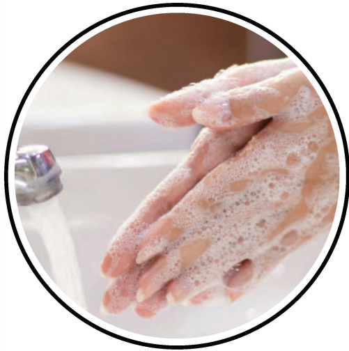
Step 1: Wash hands with soap & water and dry thoroughly.