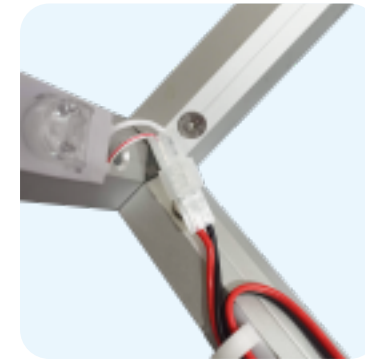
2. Connect the wires