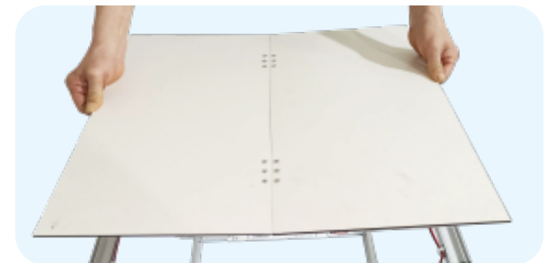
3. Put on the counter top