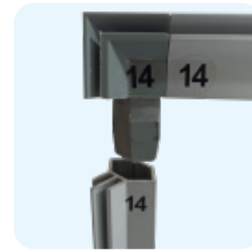
1. Assemble The Profiles (follow numbers)