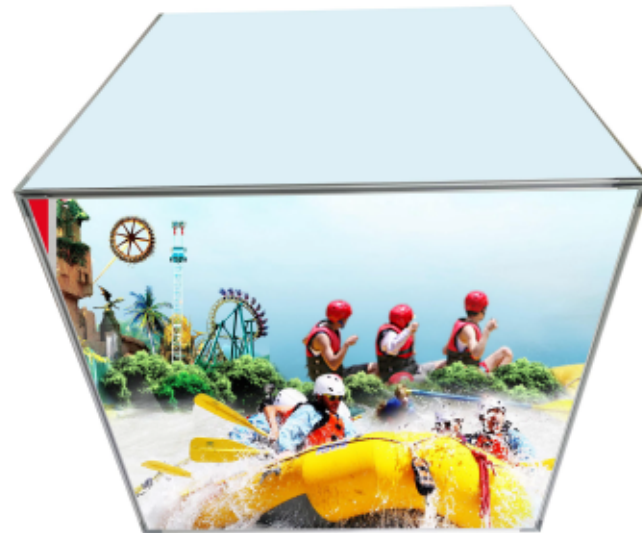
4. Put on the graphic