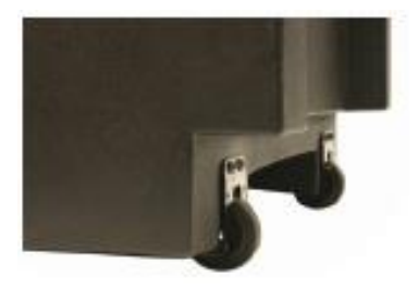
Heavy Duty Casters