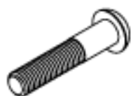
Socket Cap Bolt (x8)