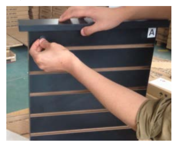
5.Snap screw caps into place to cover cam locks.

4. Flip unit over and secure Bottom C to Center Panel A using provided wood screws and allen key.