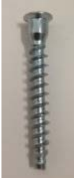
WOOD SCREW (x8)