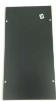
SIDE PANEL B (x2)