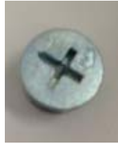
#58 CAM LOCK (x8)