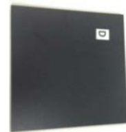
TOP PANEL D (x1)