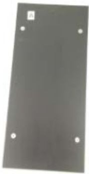
SIDE PANEL A (x2)