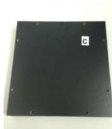
BOTTOM PANEL C (x1)