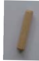
DOWEL PIN (x4)