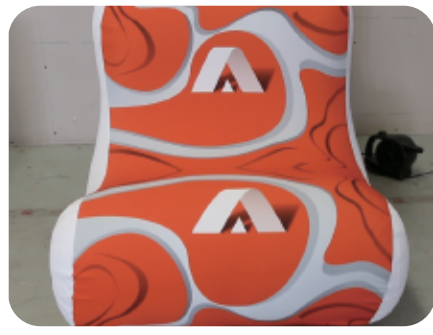
9. Place the air chair at its upright position. The assembly is finished.