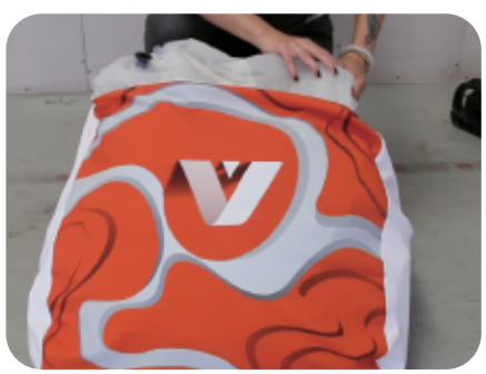
4. Inflate 1/3 of the air chair from the valve, place the air chair inside the cover.