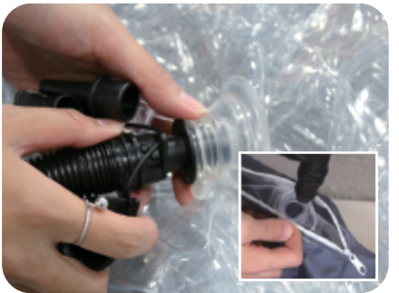
3. Open the valve and connect with the pump to inflate.

2. Unfold the air chair, locate the valve.