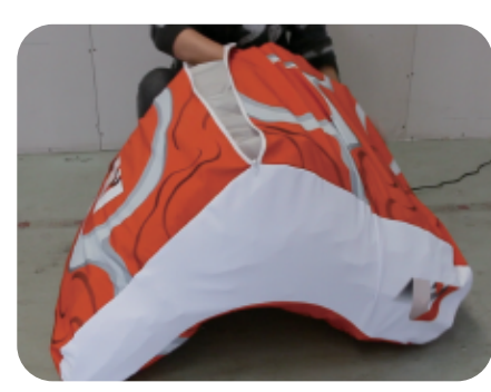
7. Adjust the cover, then fully inflate the the air chair.