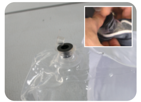
5. Close the 1st valve tightly. (See image on the right)