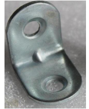
L Brackets X 2