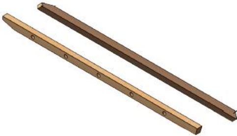
Left Frame X 1 & Right Frame X 1