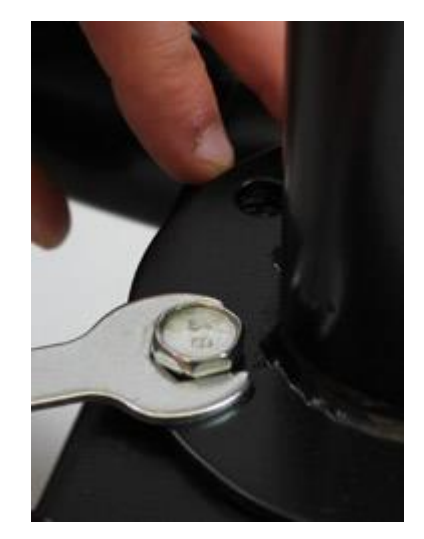
Place in all (4) bolts with "48" label on top, and screw in with one of the provided wrenches.