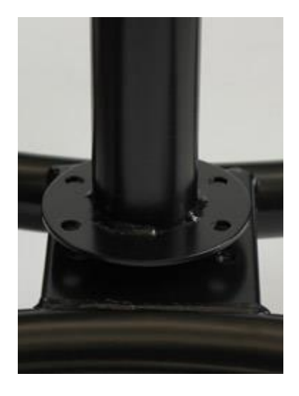
Once metal base is right side up, place base pole with round bottom on top of the center of the base, lining up the holes.