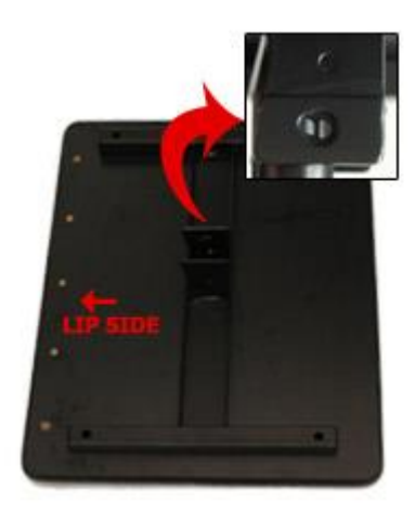
Separately, place the shelve face down, and then place the shelf mount bracket on top of it, lining up the holes. Make sure the part of the shelf mount bracket with two holes (enlarged image) is on the proper side in accordance with the lip side.