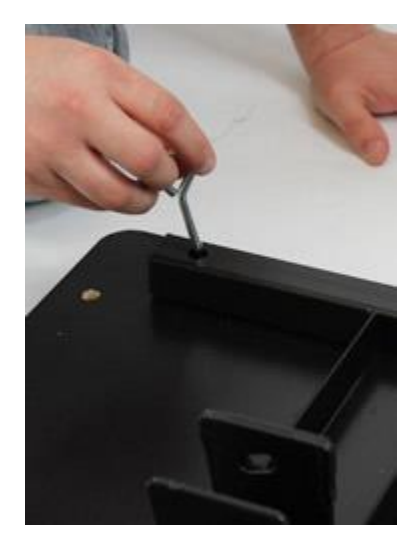
Screw in short bolts to secure shelf mount bracket.