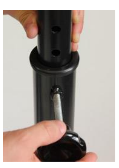
Insert the large of two knobs into the opening pictured and put adjustable height pole at desired level. Line up both poles and twist the knob all the way in.