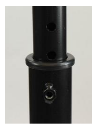
Once base pole is secured to the base, slide in the adjustable height pole to the top of the base pole, ensuring the openings are on the same side as pictured.