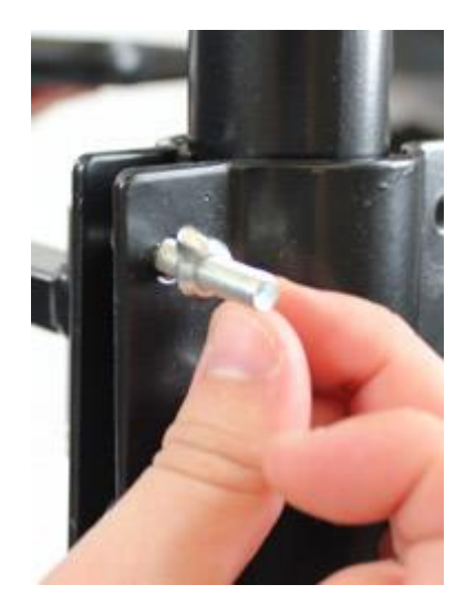
Line up shelf bracket and secondary bracket piece anywhere on pole, then use four bolts and wing nuts to secure into place. Shelf height can be adjusted at any time.

Place shelf top face down, and line up bracket mount with predrilled holes, and then use short screws to put it in place.