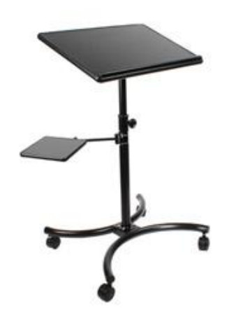
Your stand is now complete!