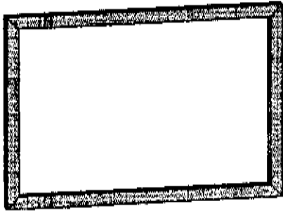
Double sided light box