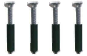
Screws & Anchors