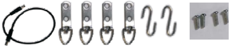
Daisy chain kits