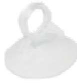
Suction cap x 1