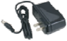
Adapter x 1