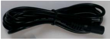
Extended wire x 1