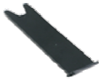
Easel x 1