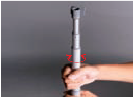
4. Set the pole to desired height by twisting sections in opposite directions.