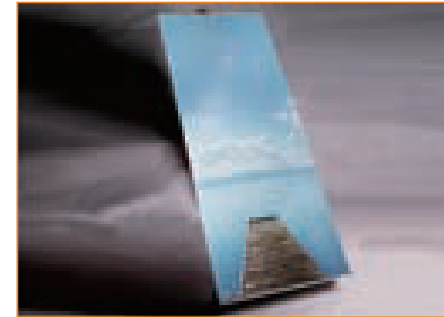
6. Tilt the unit toward yourself while raising the graphic to the top of the pole.