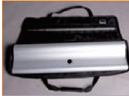
2. Open bag.