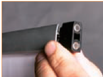
8. If using side-by-side with another banner, use the magnetic endcap, otherwise use the standard endcap.