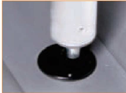
5. Insert pole into base.