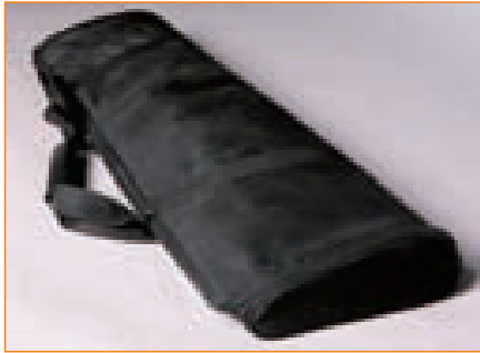
1. Base in bag.