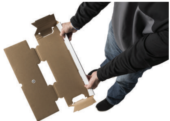
6. To form shelves (C1 & C2), fold front perforated lip up and over tab of shelf sides