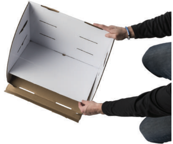
4. Insert bottom shelf cover (D) on top of (A)