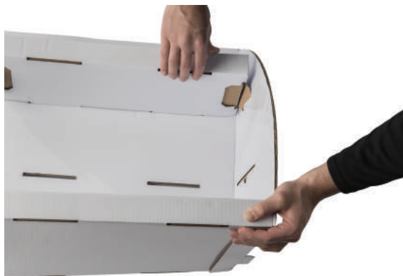
11. Insert bottom tab of shelves (C1 + C2) into side panels of body (B)