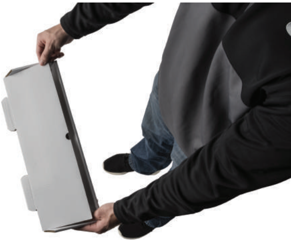
9. Fold top of tray over into place