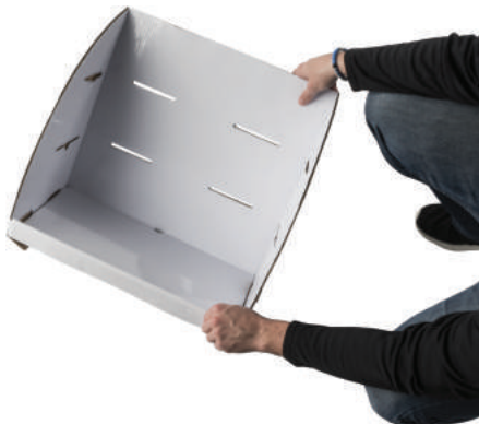
5. Fold front lip of base (A) over to form the bottom tray