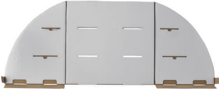
1. Open body (B), laying flat, folded in half