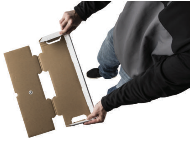
8. Fold over sides - insert tabs into base slots