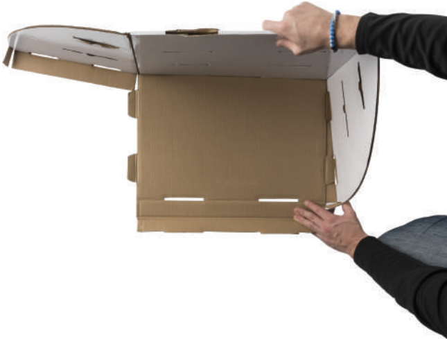
3. Stand unit upright and insert tabs on sides of body (B) into base (A)