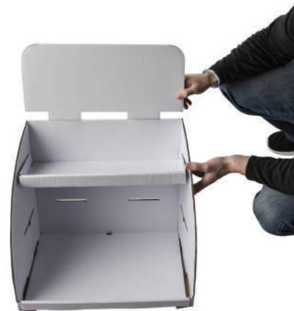
12. Insert removable header