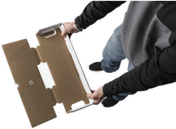
7. Insert tabs from front lip into base of tray