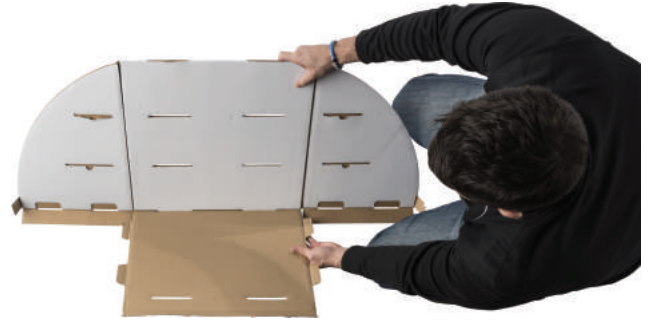
2. Take base (A) and insert tabs from body (B) into slots of (A) NOTE: make sure perforated flap of base (A) is in front