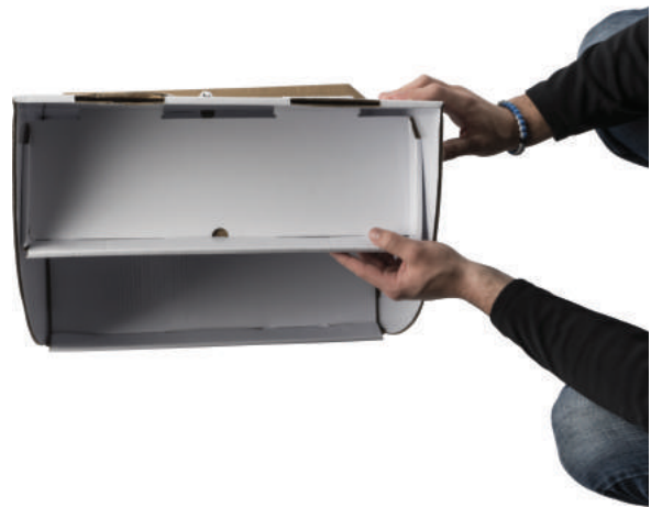
10. Insert shelf tabs into body (B) back slots