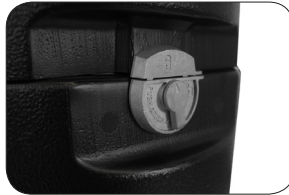
Push & turn locking mechanism