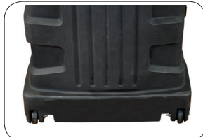
Recessed wheels and handle