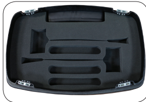
Foam padding for lights