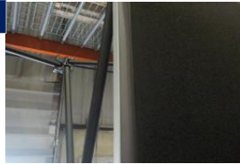
Keep panel aligned with one of magnetic bars two sides