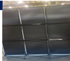
Back fully assembled