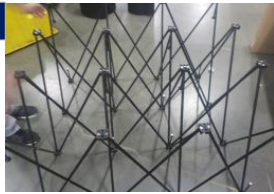
expand pop out frame by pulling away from frame