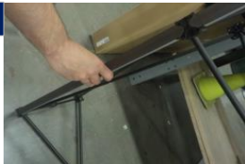
connect magnetic bars to magnet buttons on frame