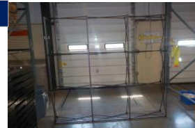
frame with magnetic bars