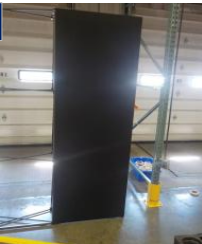
1 panel assembled