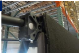
Place magnet clip to magnet button on frame(always connect to most inward magnet)