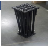
pop up frame