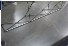
magnetic bars will go at the bottom of frame but not the top