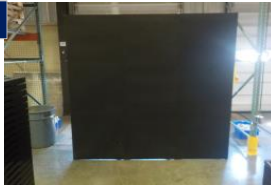
Front fully assembled