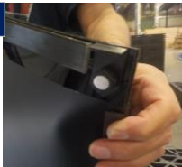
Magnet clip on panel