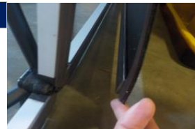
connect bottom magnet strip to bottom magnetic bar