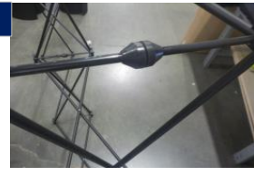
what magnets connectors look like connected