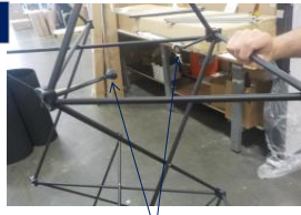
connect magnet connectors