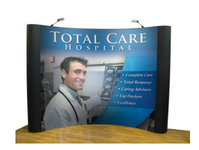
Curved Tradeshow Booth With End Cap